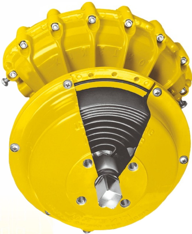
Spring housing cut away